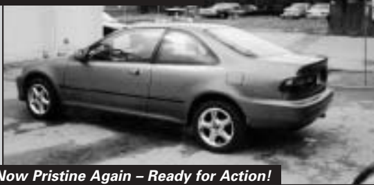
Now Pristine Again - Ready for Action!