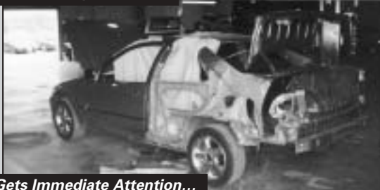
Gets Immediate Attention...